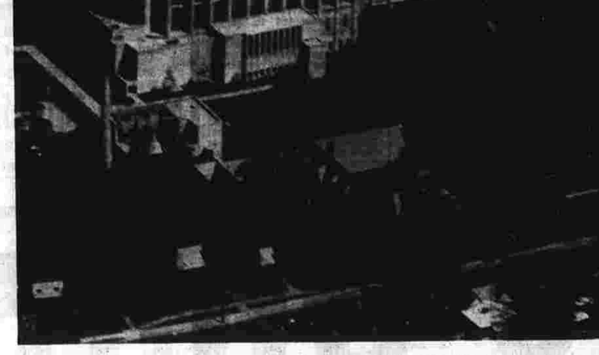
CATHEDRAL OF ST. JOSEPH, Farmington Ave., Hartford

Connecticut Yankee The rather savage blows the judiciary, deciding always, of course, in the interests of a more perfect democracy, has struck to the prestige, tradition, and power of the legislative branch have been paralleled, somewhat, by things the judicial branch has been doing to itself.